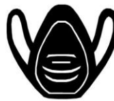
Protective Clothing Pictograms